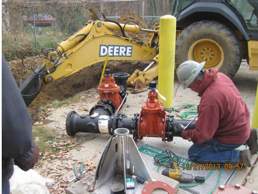
Bypass piping being installed at Park Avenue Pumping Station.