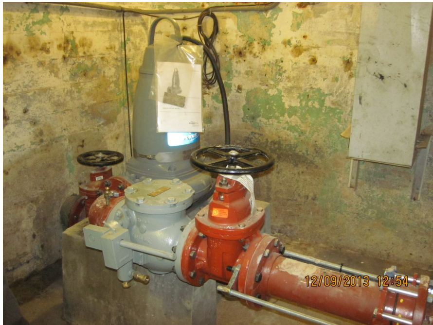
A new pump, valves and piping also at Park Avenue Pumping Station.