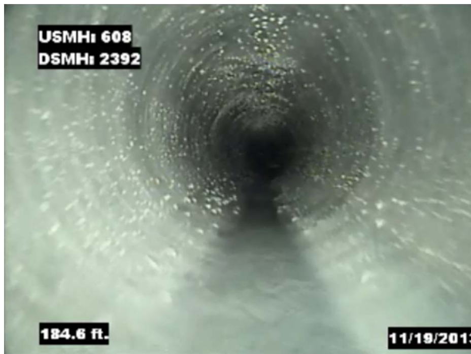
Video Inspection of same pipe after rehabilitation using Cured-In-Place Pipe (CIPP) lining.